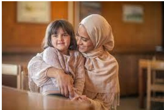
An Internet photo of an Afghan mother with her daughter.

Sunday Worship service will be Streaming live on Facebook on Sunday at 9:00 am. The bulletin will also be available on Facebook and the church website ( www.unionfirstpresby.org ), posted by 8 am Sunday morning.