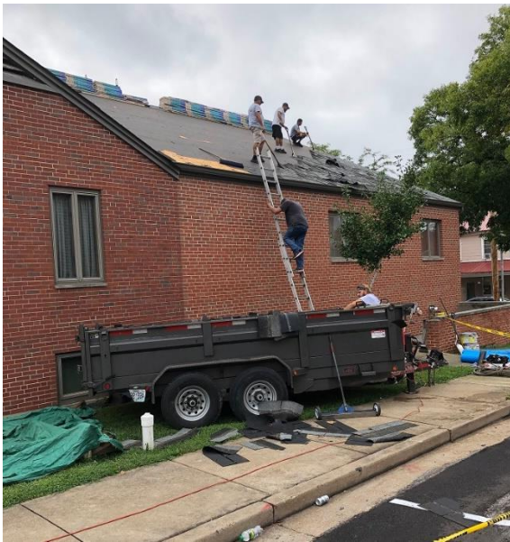
Taking off the old shingles

On August 27, Brunsmann Roofing replaced the west-facing roof that was damaged and leaking after a Spring rain storm.