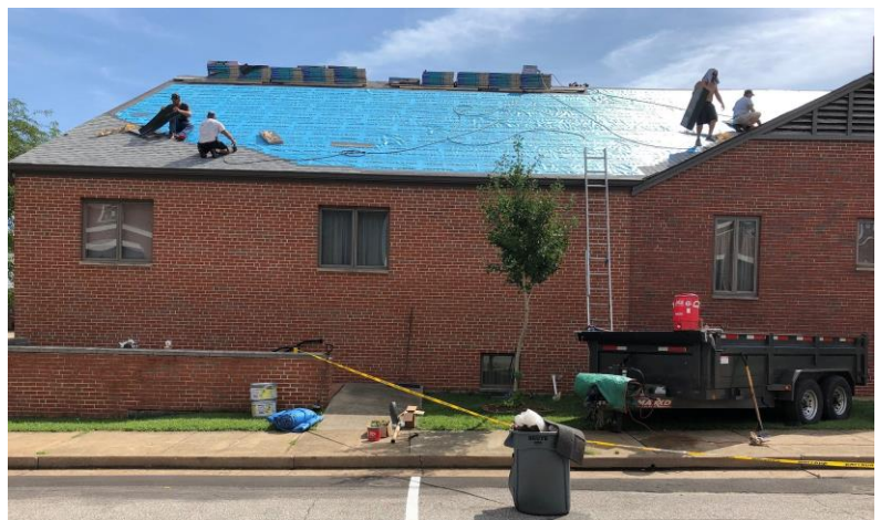
Blue underlayment and beginning of laying shingles