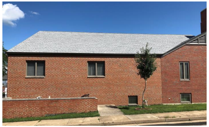
Work is complete